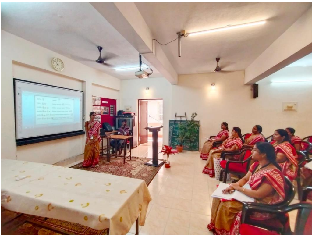
Student-teachers experiencing the applications of SMART Interactive White Board

SMART Interactive White Boards in NKT College transform learning to experience latest digital world to take the next step towards transformational teaching and learning.