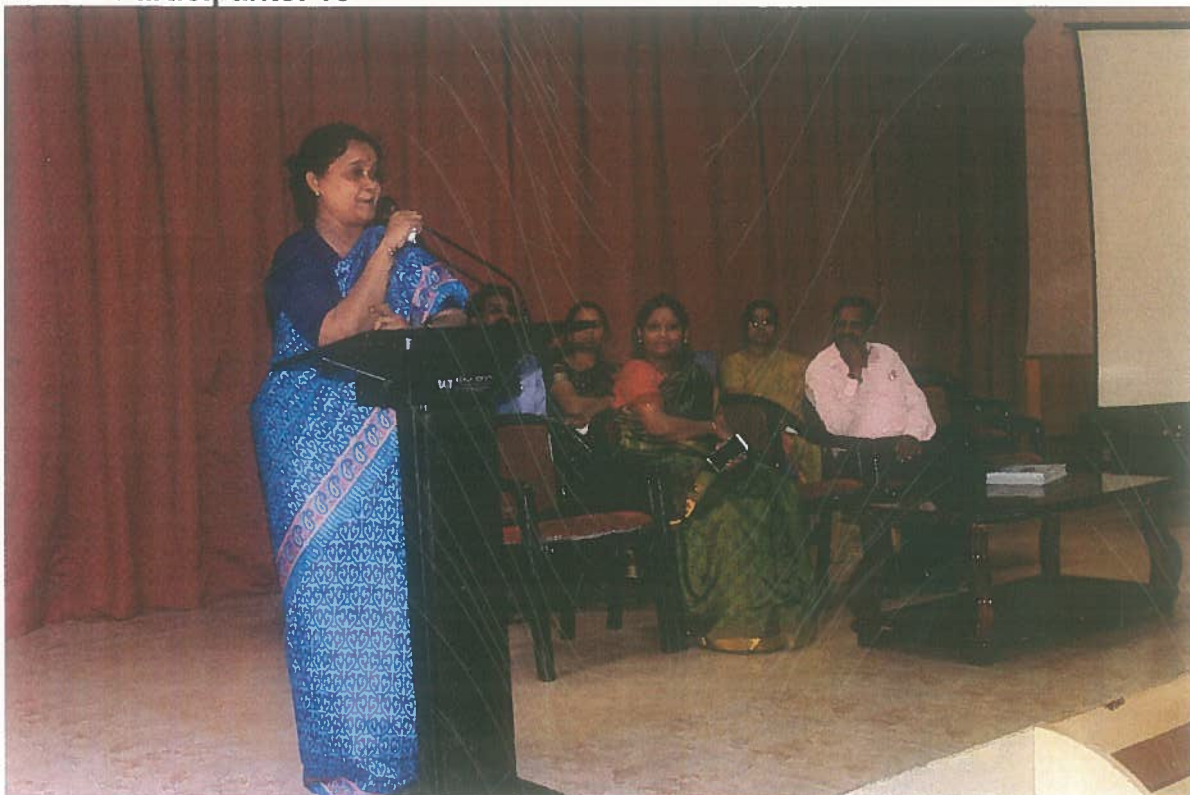
Orientation Programme on Academic Software

PRINCIPAL N.K.T. NATIONAL COLLEGE OF EDUCATION FOR WOMEN (AUTONOMOUS), TRIPLICANE, CHENNAI-600 005.