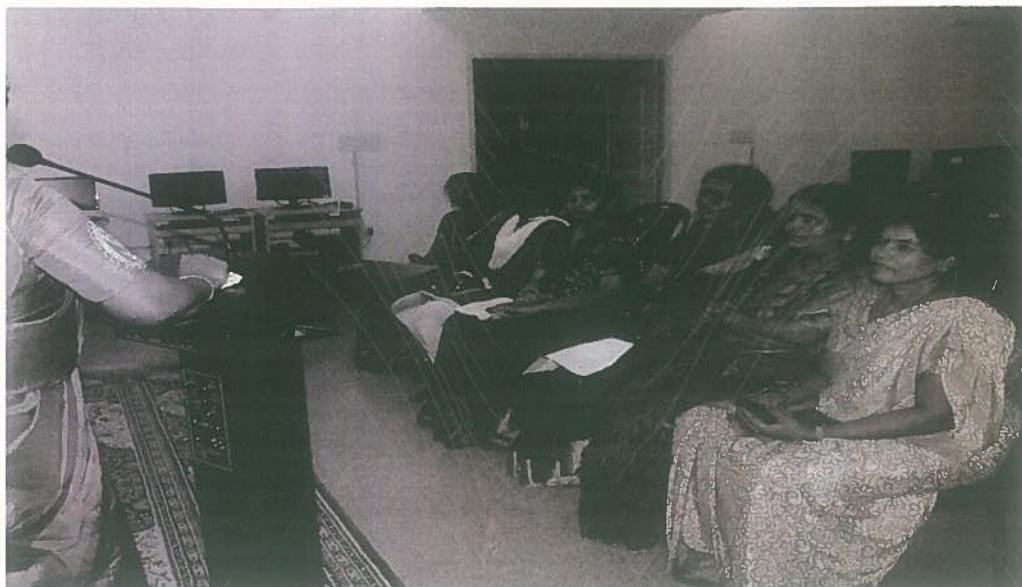
Learning to Lead

Programme No: 4 Date: 10.09.2016 No.of.Participants:8