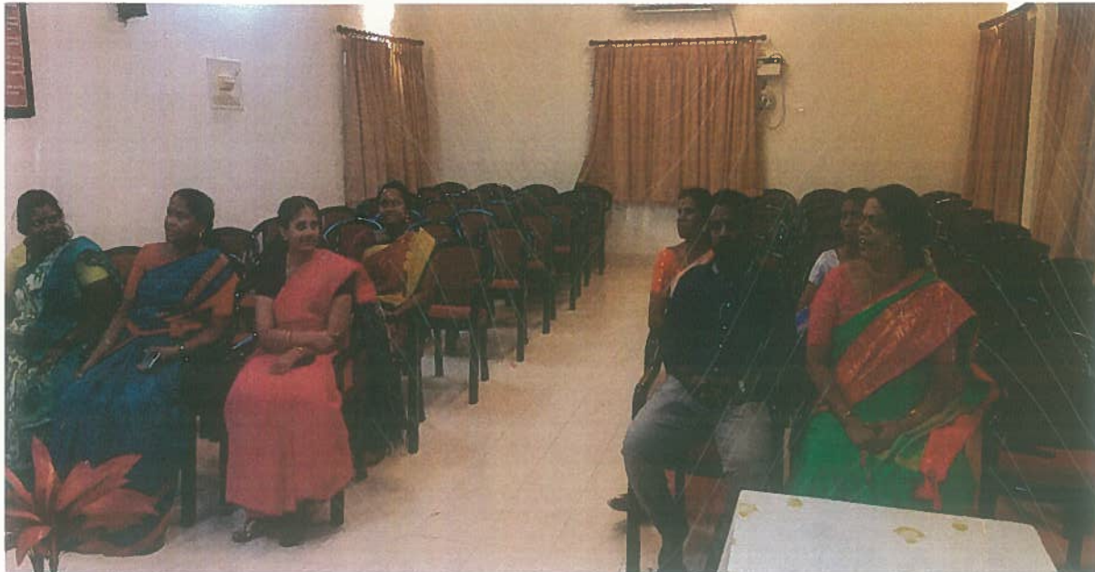
Improving Interpersonal Relation Competency

Programme No: 2 Date: 11.02.2017 No.of.Participants:8